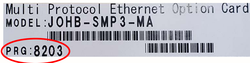
Fig. 2 Example of firmware version 8203 on the option card packaging

The protocol firmware can be found on the label placed on the ethernet ports of the option card, or on the option card packaging (PRG).